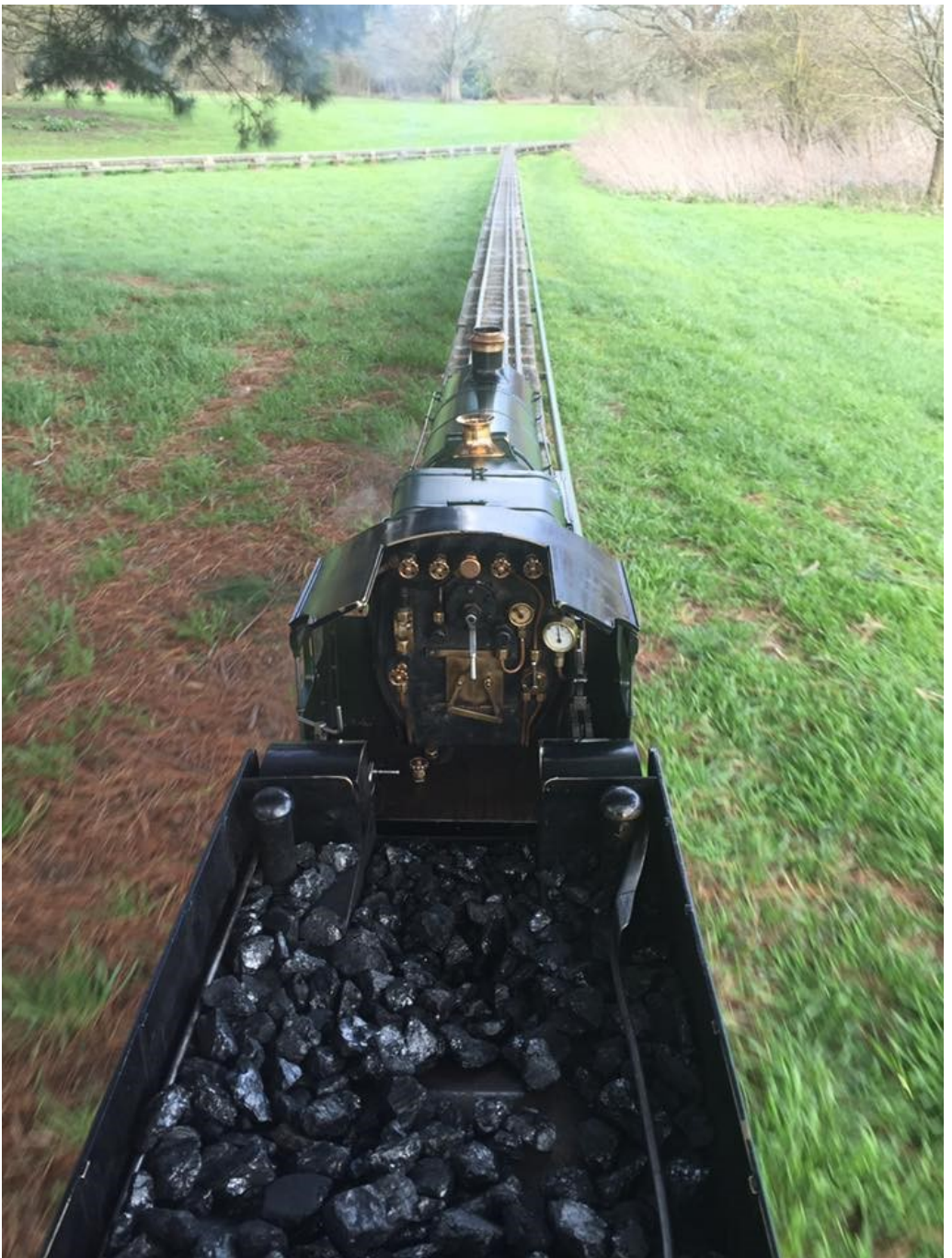
Above: Drivers eye view on Easter Weekend, the start of public running for 2016 - S Parham