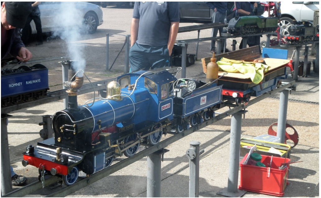
Above: Raising steam at Beechurst - A Bridges